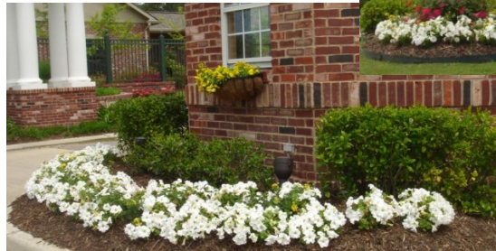
Seasonal color added to the Front Entrance