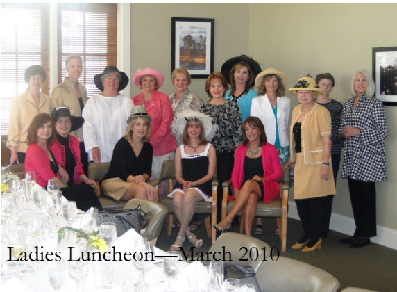
Ladies Luncheon—March 2010

Plantation Pix: for more pix visit the photo gallery at www.theplantation.com