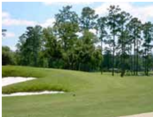
LOT 8-B OVERLOOKS FAIRWAY 13