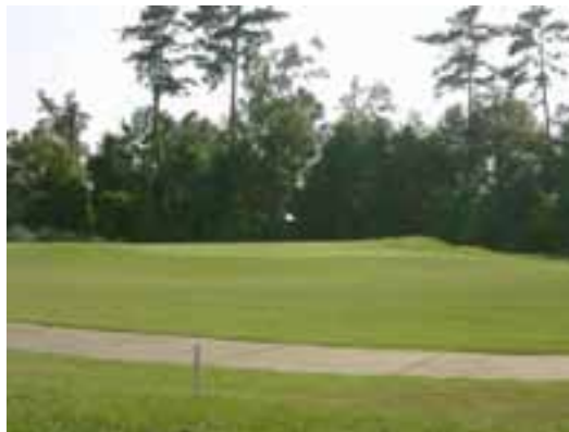
LOT 54 OVERLOOKS 8th GREEN

Many of the above featured sites are priced below market. Now is the time to check out these sites.