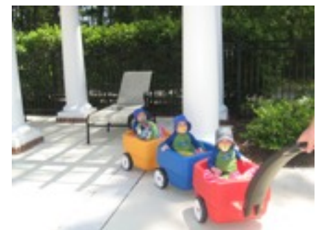
Anderson's got three at once!!!